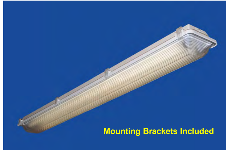
Mounting Brackets Included